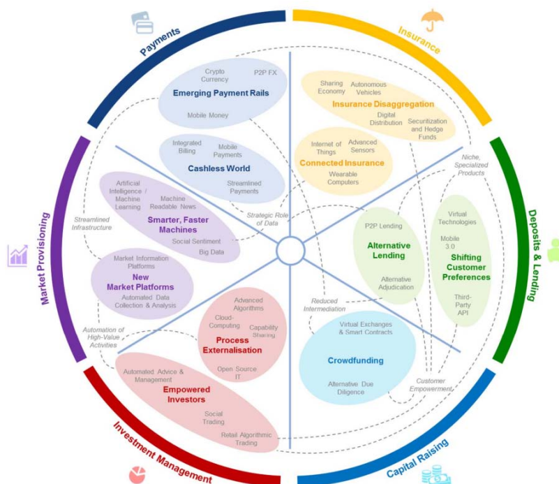
Figure 1: WEF Fintech innovation research framework (WEF, 2015)

Because Fintech industry had growing so fast, many studies had done to emphasize the innovation within the financial services industry. The most popular Fintech Innovation framework is World Economic Forum’s 2015 report – “The Future of Financial Services”. WEF report identified 11 key clusters of innovations based the impact to six core functions of financial services as the following figure 1.