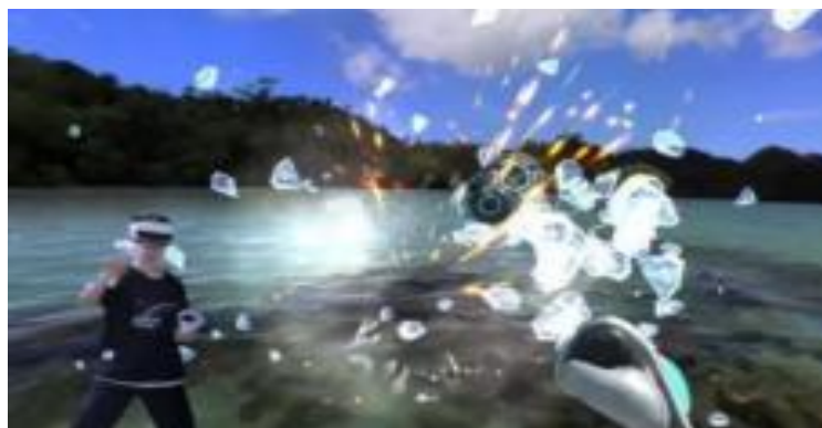
Figure 2: “Sizzling Moment” Game Screenshot.

This study uses a survey method to explore how VR fitness game design influences health behavior change. Data were collected through an online questionnaire distributed randomly among undergraduate students, a group actively embracing new technologies and media, making them ideal for examining VR gaming trends. Focusing on college students also helps mitigate variables like age and education level, streamlining model construction and data analysis. We first invite participants to watch a simulation video of “Sizzling Moment” (Figure 2) via a provided link in the questionnaire and then completed the survey based on their experience. “Sizzling Moment” is a free boxing VR game on the PICO VR platform, recognized with a 40% vote rate in the 2022 “VR Application of the Year” list, reflecting its popularity among users and in the market. This game serves as the foundation for our questionnaire. A total of 252 questionnaires were collected for this study.