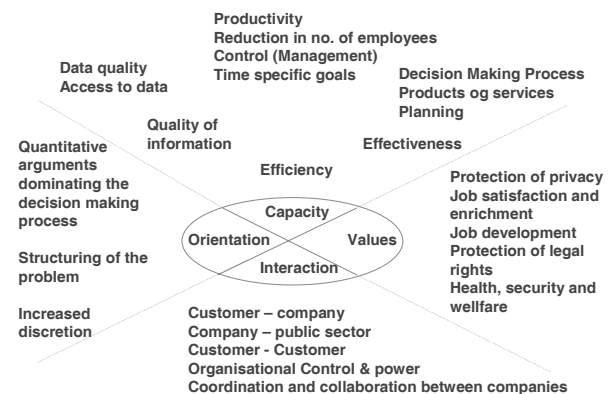
Figure 4: Content Variables.

Content variables in a CBA may include capacity, interaction, values and orientation. The capacity variable deals with the quality of information, efficiency and effectiveness. The interaction variable focuses on control and power, including customer relations. Values comprise e.g. stress and legal protection. Finally, orientation relates to how often the Internet solution leads to a more digital decision-making process reducing other communication and decision forms. In a large-scale international study, we have found that the effects are unmistakably positive on the capacity side, but predominantly negative on the value side.