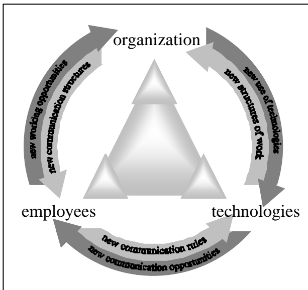
Figure 1 The “ETO-triangle” as a frame of research

This paper deals with changes in working principles and communication environments during the introduction of computer-mediated information and communication in companies. Our findings indicate that social consequences (e.g. decrease of hierarchical barriers, self-organization, self-responsibility) are interrelated to organizational (e.g. management of change), technological (e.g. infrastructure, implementation) and personal dimensions (e.g. experiences with media use, gender, position). Figure 1 illustrates the assumed interdependencies.