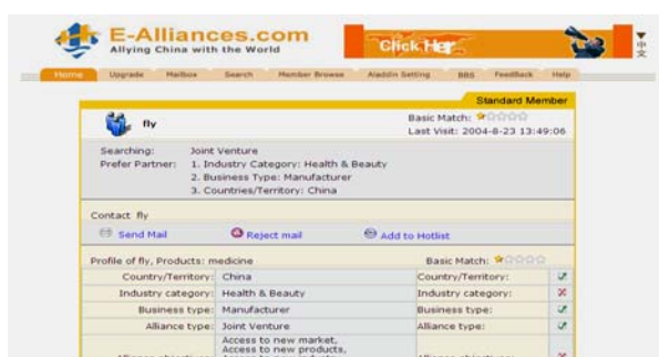
Figure 3. Illustrated prospect profile

The sequence of prospect list is sorted in Basic Match status based on their match level of criteria preset in Aladdin setting. The search firm can further review a prospect's profile by clicking its username as shown below