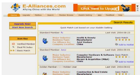
Figure 2. Illustrated list of quick match

The sequence of prospect list is sorted in Basic Match status based on their match level of criteria preset in Aladdin setting. The search firm can further review a prospect's profile by clicking its username as shown below