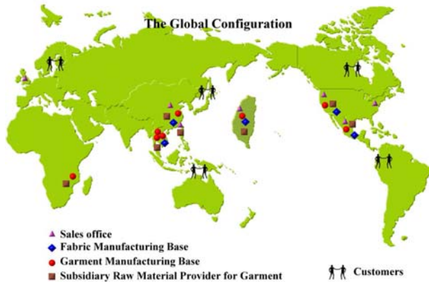
Fig. 2 The global configuration of J Company

The as-is and to-be business models of J Company are illustrated in Fig. 3. J Company always tries to employ different e-strategies for improving its operational condition and performance. After employing the supply chain typology analysis, the business model was changed. A global logistics center was set up in charge of integrating two major product business, i.e., fabric division and garment division. Originally, the fabric division and the garment division do business nearly independent, lacking of integration. Its to-be business model integrates the fabric and the garment divisions vertically to take orders jointly to maximize the profit of the company. Once the business model of a company is changed, the processes are also changed. Therefore, it is very important to find appropriate performance metrics. It is important for an enterprise to find out the most appropriate evaluation performance index.