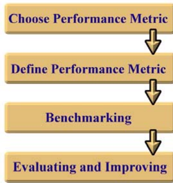
Fig. 1 The Steps of supply chain performance analysis

The first step is to choose performance metrics. There are five perspectives of metrics in SCOR: reliability, responsiveness, flexibility, cost, and assets. After choosing the metrics, the metrics are defined. Interviews on top managers are performed to ensure that the definitions of the metrics are the same for members within the supply chain. Comparison is made by benchmark data in the third step to find the gap rate. Finally, results are obtained by checking the gap rates and used to improve the performance. The details are mentioned as follows.