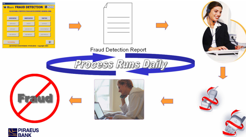
FIGURE 3 – Fraud detection daily process