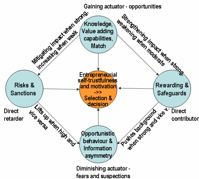
Figure 3. Ownership management framework

The proposed determinants for the ownership management framework are shown below in Fig. 3. The model sums up the theory discussed in this paper and presents the logic model of knowledge investing in the venture and firm growth process beginning from the investment decision through to the stage of connecting to the process and team building and up to a coherent stage where all team members are aiming at a common goal – the growth of the business. 2