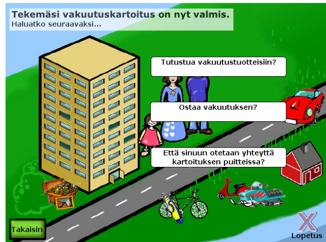
FIGURE 3. EINSURANCE SERVICE – FURTHER ACTIONS PHASE

The service provides also useful information related to the different risk factors in the user's life. The risk information is shown in balloons that are displayed whenever the user places the mouse cursor on top of any object in the selection phase. The balloon consists of either statistical information for instance on common accidents or basic information on insurance products concerning that object.