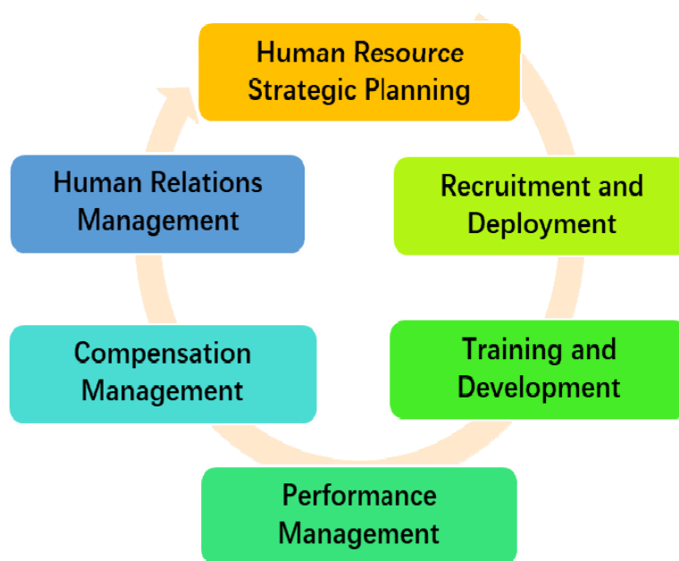
Figure 2: Six dimensions of human resource management.