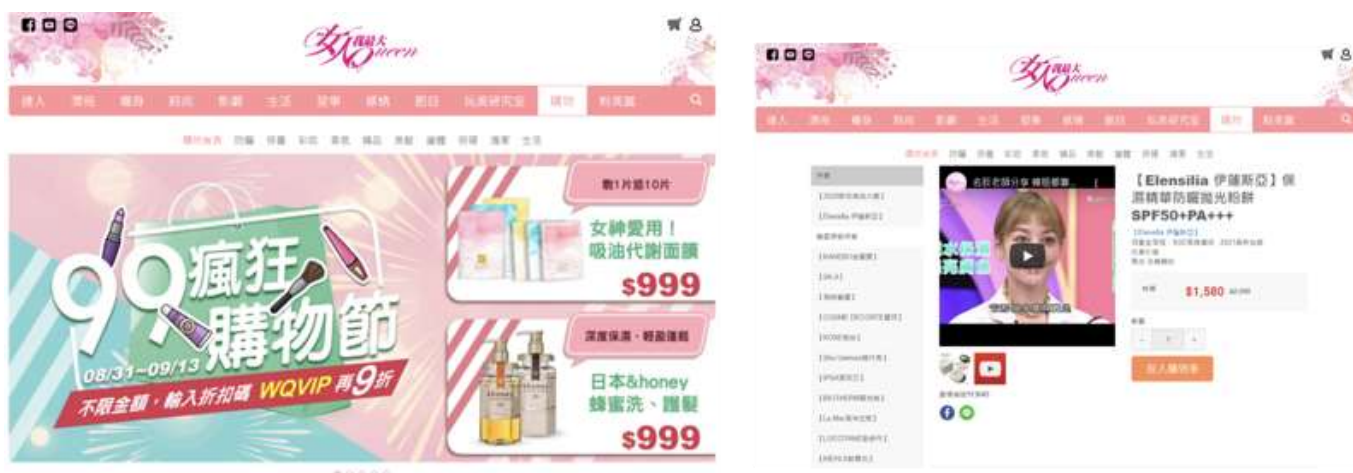
Figure 2: "Women, I'm the Biggest" TV program websites

For example, the digital original programs developed by each IP, the biggest "playing beauty research room" by the woman, and the "William Shen Happy Delivery" from the hot shop at 11 o'clock, the video can reach more than 100,000 views in three days. In addition, it has developed a dedicated APP and e-commerce platform. In recent years, it has developed exclusive IP apps. The "TVBS News" APP has 1.3 million downloads.