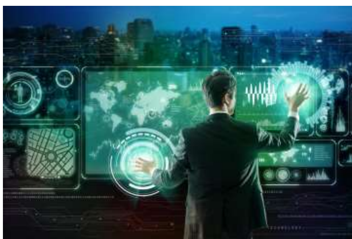
Figure 5: Urban planning and construction in metaverse.

The metaverse can improve scientific planning and smart construction of cities (Figure 5). The metaverse is a natural, dynamic and scientific virtual experiment site that provides an operable path for realistic smart cities construction. Using real city information and social multi-dimensional data to replicate the city in the metaverse, city residents are invited to live virtually in a city with different scenarios to flexibly preview planning effects and to discover planning problems and defects in advance, so that multiple scenarios can be compared, researched, optimized and selected. After determining the suitable planning scheme for the city, the city builder can present the details of the public facilities layout, building structure, greenery planting, etc. of the city construction in the metaverse before the construction starts, and even deduce the possible urban problems that may arise during the construction process for the reference of engineers, builders and managers, and create a precise, dynamic, stakeholder-engaged and sustainable smart cities.