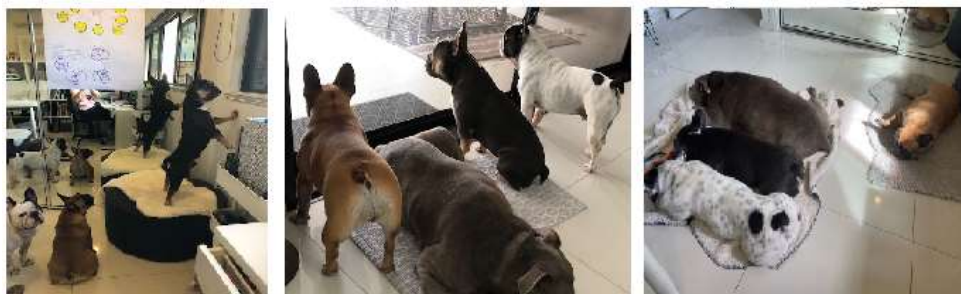
Figure 2: The weekly survey response rate by age and education demographic cohorts showing the extra stimuli (S = slide; V = video; F = animals) used as an inclusion in the weekly reminder notice to elicit responses. Images of the animal stimuli are shown. The disparity in the number of responses between the two cohorts reflects missing response data to the survey question.