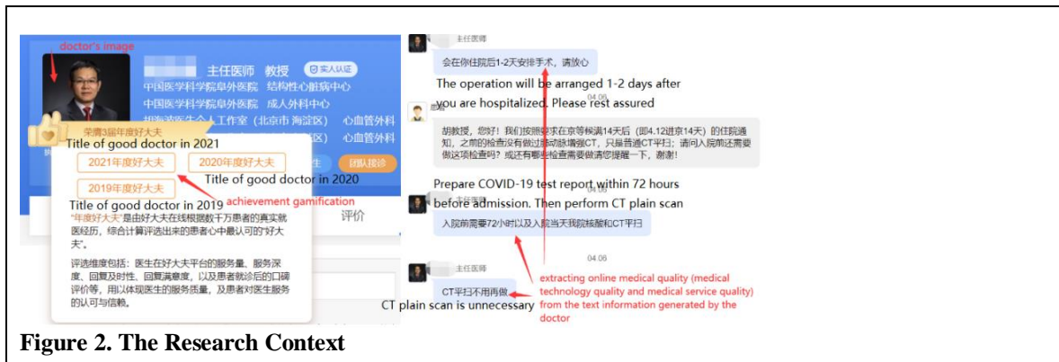
Figure 2. The Research Context