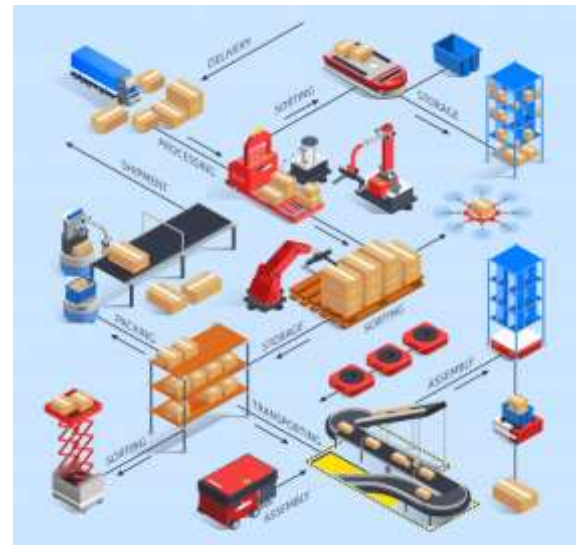
Figure 1b: Smart Warehouse ( https://vakoms.com/ )

Automation at the digital process level begins with the programmed inclusion of mobile devices connected by wifi into the warehouse network and its warehouse management system. Software development applications and API's are added to expand intelligence and functionality of storage systems and associated robotics. This increase in data capture makes digital security increasingly important, and requires the introduction of secure cloud database storage systems. As robotic devices expand in function and intelligence machine learning algorithms are introduced and then the entire warehouse management system and its overall data analytics platform is continually recalibrated to deliver required solutions (Jenkins, 2020).