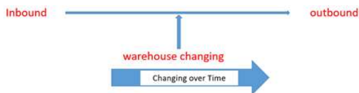
Figure 2: Warehousing in the business supply and value chain

Smart warehousing - the centrepiece of Figure 2, encompasses future strategic factors for inbound materials, smart storage, and the outbound remix/repackaging into smart logistical downstreaming.