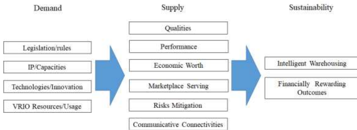
Figure 3: Proposed Research Framework

Using quantitative data capture techniques, this stagewise combination of contributing components facilitates statistical investigation options using either smart PLS, or structural equation modelling, or possibly multi-level Mplus modelling. Figure 3 enables capture of these component measurement domains into a suitable quantitative three stage framework structure. A series of qualitative open-ended questions attached to the quantitative survey. The qualitative analysis tool NVivo and its theme-based analysis processes can provide word cloud, word tree, project map, and 3D spatial analysis, and these collectively can further verify the quantitative modelling solution.