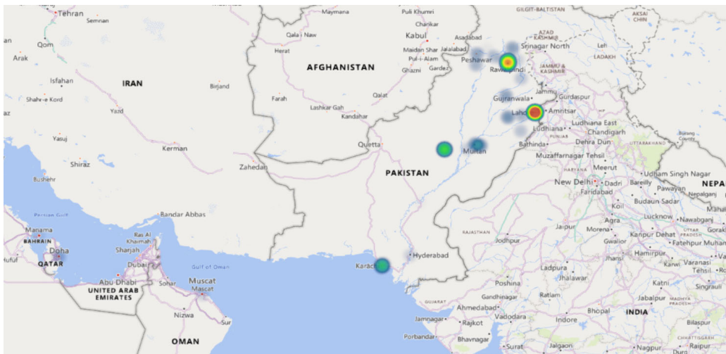
Figure 2: 2D Map of Respondent Regional Survey Location Heat Map with Regional Density Checks

Engaging the Heat Map icon allows a relative intensity of respondents to be heat positioned on a 3D Map and/or a 2D Map. Figure 2's, 2D regional survey respondent heat map approach allows multiple relative respondent locality distribution checks to be instantly mind-mapped. Further, this allows in-depth comparative understanding of survey respondent intensity sub-sets within or around a localized population, or within the targeted overall survey population domain. This can further validate the representativeness of the respondents within, and across, the targeted overall survey population domain.