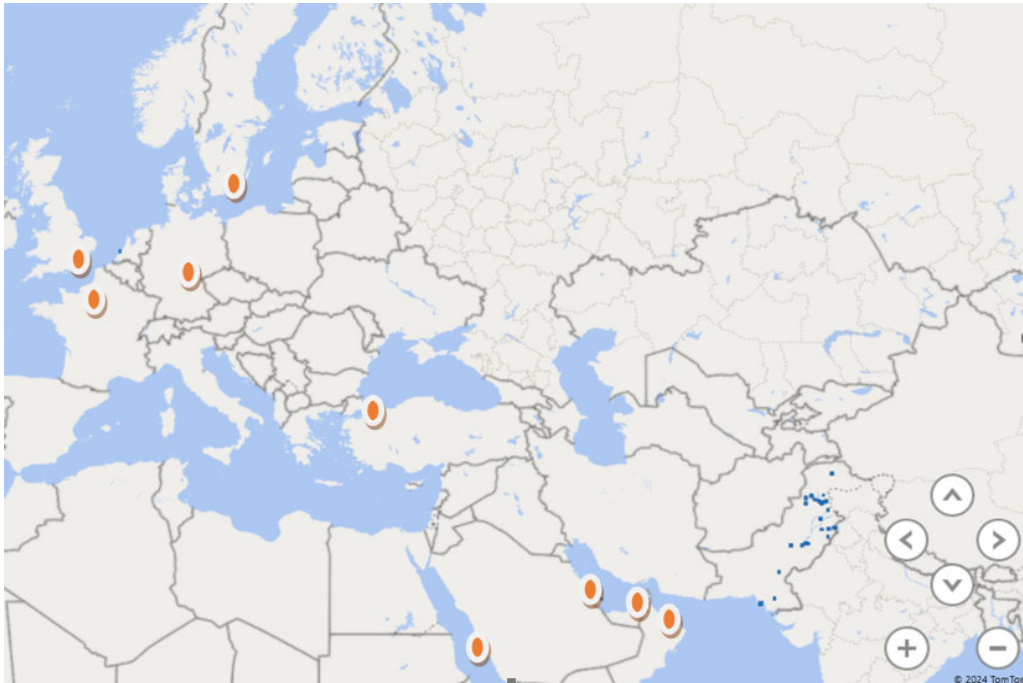
Figure 1b: 3D Map of Respondent Global Survey Locations with Respondent Clusters Outside Pakistan

With the 'IDNo, StartDate, EndDate, Status, IPAddress, Progress, Duration (seconds), Finished, RecordedDate, Latitude, Longitude extracted to Excel, the 'CTRL' key is depressed and held to highlight the IDNo, the latitude, and the longitude columns (headings included) and their data only. Next > select the Insert function (this activates access the 3D Maps icon). Next > select the 3D Maps icon > select (+) New Tour > select Open New Scene > select World map (this yields a rotatable World map) > click on location box to the right of the map > select Add Field > click on Longitude (add longitude field to location box) > click on Latitude (add latitude field to location box) > above this location box > select from 5 data icons, the second from right (heat icon) > view World map and drag and rotate to areas to localities where most of respondents are likely located. This process is summarized in the Figure 1 sequence below. Now select 2D Map and zoom-out to see part or all of the World and the survey respondents' localities (refer Figure 2). These 3D and 2D world maps are downloadable, complete with each survey's latitude and longitude points. Each specific location can be visually located in conjunction with excel maps major city locations, and/or even a specific contour map geographical terrain.