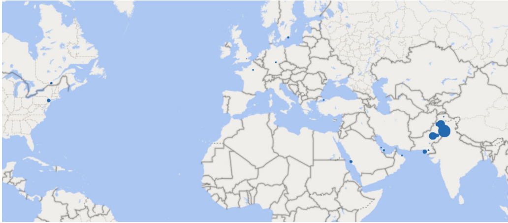
Figure 3: 2D Map of Respondent Global Survey Location Intensity Map with Global Bubble No. Position Checks

Engaging the Figure 3, 2D map of respondent global survey localities as a size intensity (bubble) map allows visualization of the relative location density of respondents. This can present as a 2D and/or 3D Map. It also helps differentiate and clarify the positional clustering of respondents in differing parts of a chosen region. This allows in-depth understanding of stronger survey respondent regional-, or locational-clustering, relative to the overall density locations across the targeted population. This in-turn further validates the representativeness of the respondents within, and across, the targeted overall survey population domain.