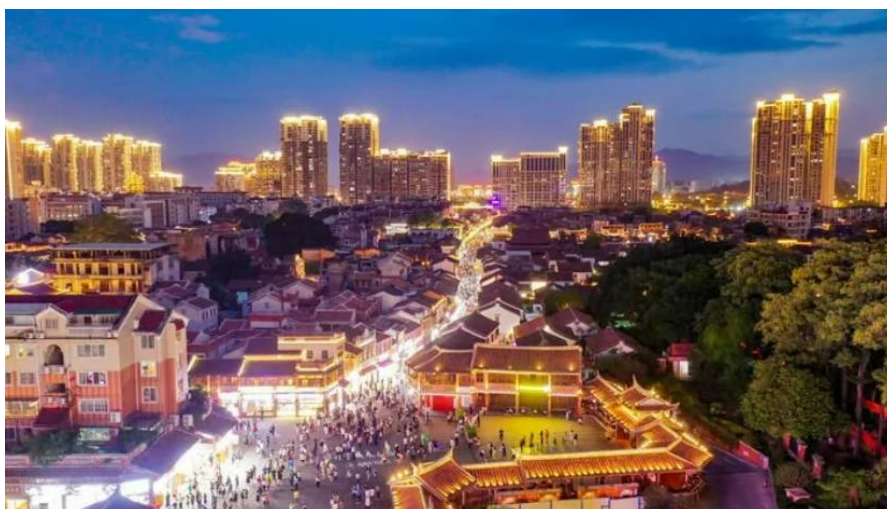
Figure 3: The Historic District of Zhangzhou (Taiwan Road to Hong Kong Road).