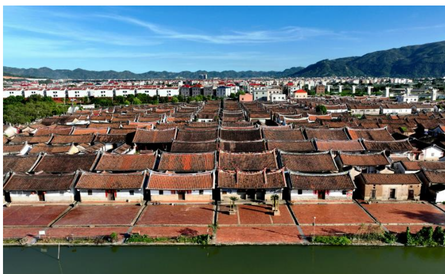
Figure 4: Dai Mei Ancient Village in Zhangzhou.