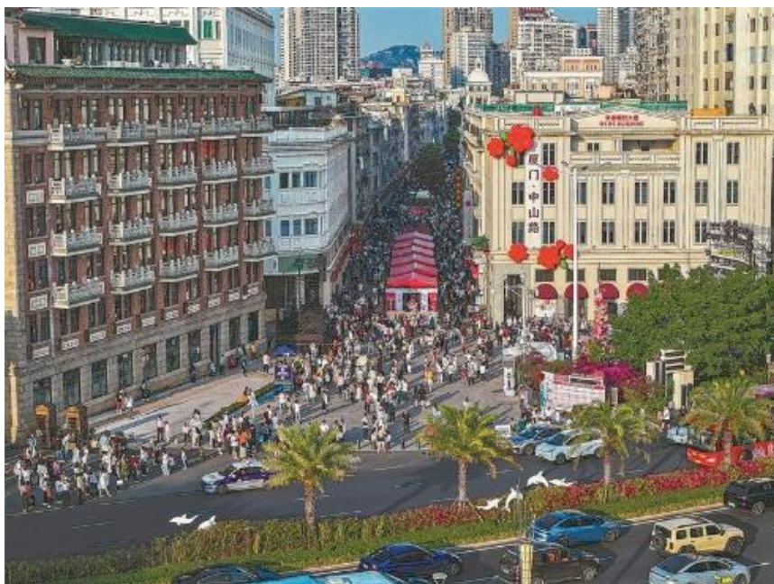
Figure 2: Zhongshan Road, Xiamen City.