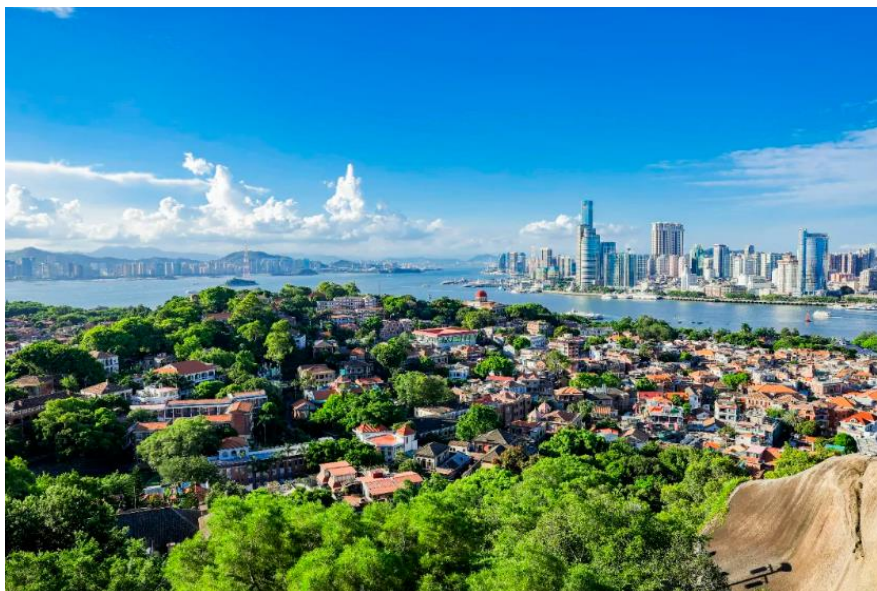
Figure 1: Gulangyu Island, Xiamen City.

In the preliminary stage of this research, a comprehensive survey was conducted on the cultural resources of Minnan's historic districts, including both tangible cultural heritage resources and intangible cultural assets. These resources were systematically categorized into material and intangible cultural systems. The study focuses on prominent Minnan historic districts with notable achievements in architectural conservation and commercial revitalization, such as Gulangyu Island (Figure 1) and Zhongshan Road (Figure 2) in Xiamen; the historic city area (Taiwan Road to Hong Kong Road) (Figure 3) and Qiaocun Dimei Ancient Village (Figure 4) in Zhangzhou; as well as Zhongshan Road (Figure 5) and Xijie Street (Figure 6) in Quanzhou. These districts represent typical, highly characteristic historic neighborhoods in three major southern Fujian cities—Xiamen, Zhangzhou, and Quanzhou (Figure 1). The research also examines the roles and interaction modes of various stakeholders involved in the activation process, including government agencies, cultural heritage management institutions, design teams, community residents, enterprises, and tourists. Emphasizing stakeholder roles and collaborative interactions is crucial for promoting sustainable heritage revitalization.