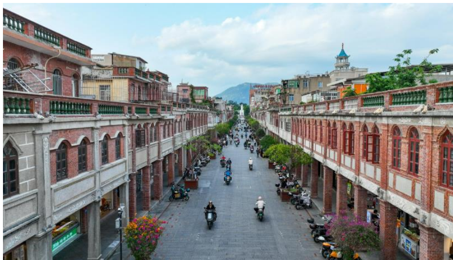
Figure 5: Zhongshan Road in Quanzhou.