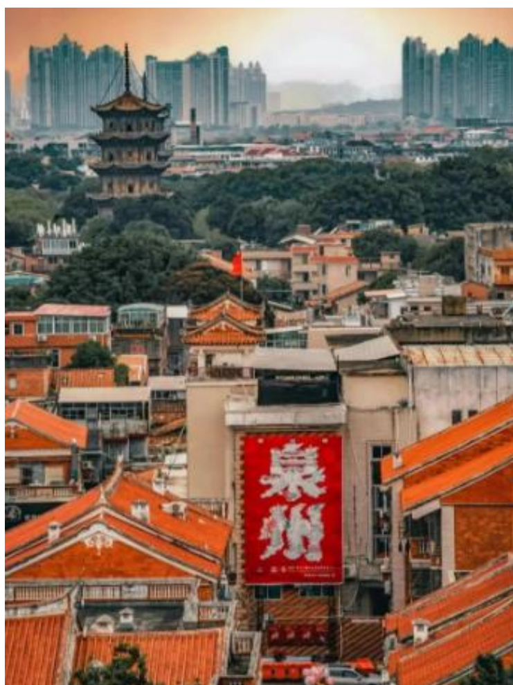
Figure 6: Xijie (West Street) in Quanzhou.